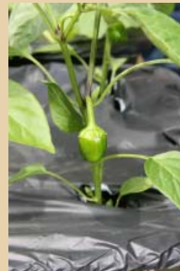
A pepper plant growing in an EarthBox.