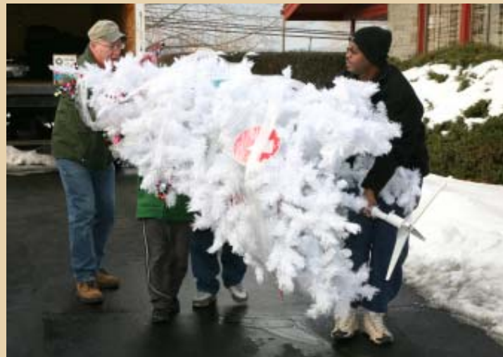
Volunteers from BAE Systems load Christmas trees donated by the Target store in Vestal for delivery to 32 Broome County families identified by United Way. This was the eighth year for this partnership among BAE, Target, and United Way to distribute Christmas trees, decorations, and even some gifts to those who might otherwise not have much of a Christmas celebration.