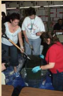
Agency representatives practice filling Earth-Boxes at the GROW BROOME training session held at United Way.