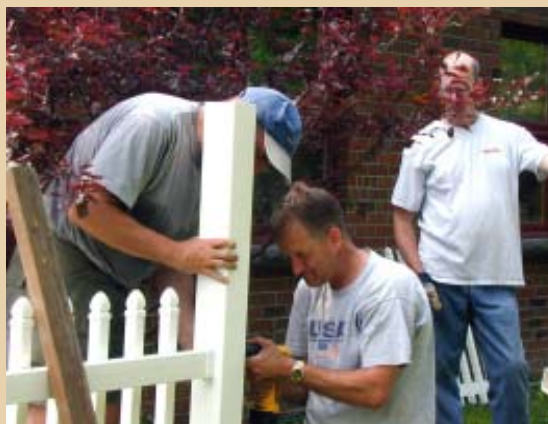
Volunteers from BAE Systems build a fence around the EarthBoxes at United Way to keep the animals out.