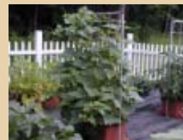
Several types of plants need a staking system.