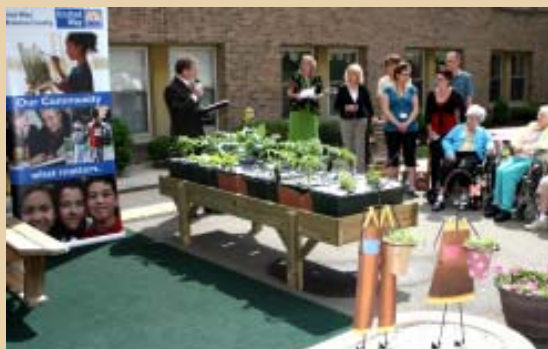
A news conference at the Hilltop Retirement Campus kicks off the GROW BROOME program for 2007.