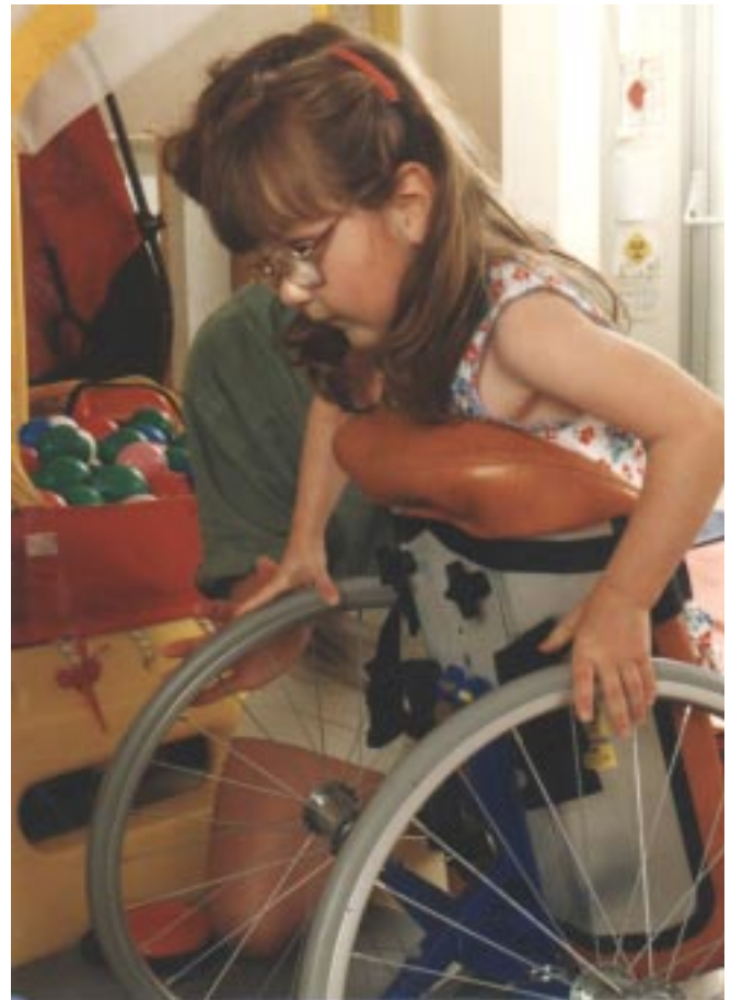
PROMOTING HEALTH AND WELLNESS: United Way's funds help children with physical disabilities gain better mobility and improve their quality of life through the Handicapped Children's Association.