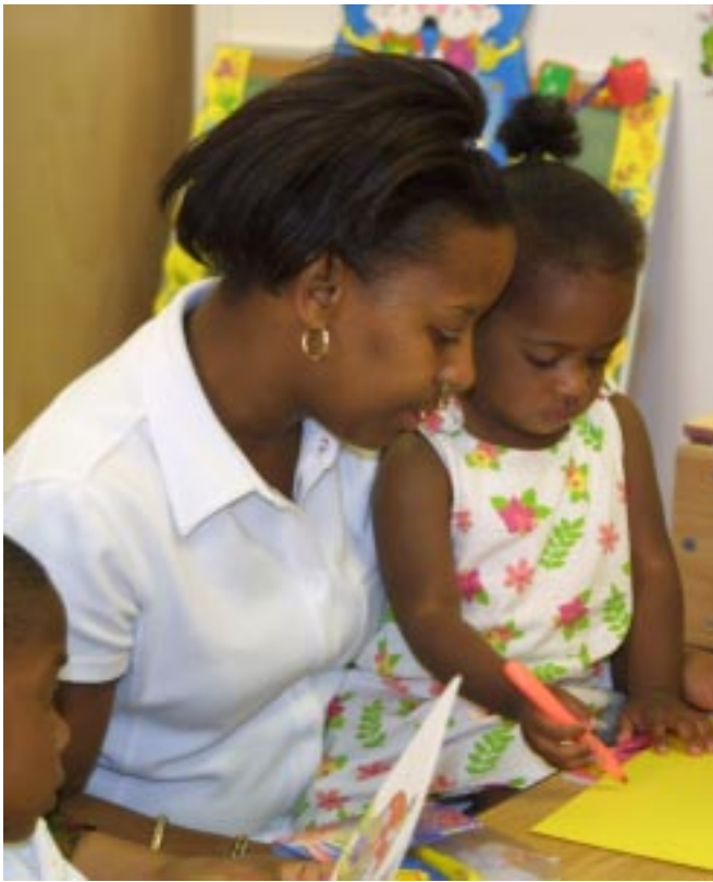
STRENGTHENING FAMILIES: United Way's funds help provide affordable early childhood education so that parents can work or attend college classes knowing that their kids are not only being well cared for, but are also acquiring skills that will help them when they begin school.