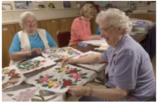
ASSISTING OLDER ADULTS: United Way's funds give seniors (like these at the Johnson City Senior Citizens Center) opportunities to get out, make new friends, learn new skills and hobbies, and be active members of their communities.