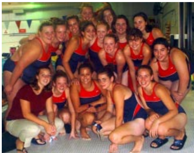
Local swimmers, such as this group from Binghamton High School, participated in the swimming marathon held at the YMCA in Westover as the kickoff for the 2003 United Way Campaign.

A total of 178 organizations were recognized with certificates for employee campaign achievements, exceeding standards set for percent participation, per capita giving, and/or increasing over their 2002 campaign results.